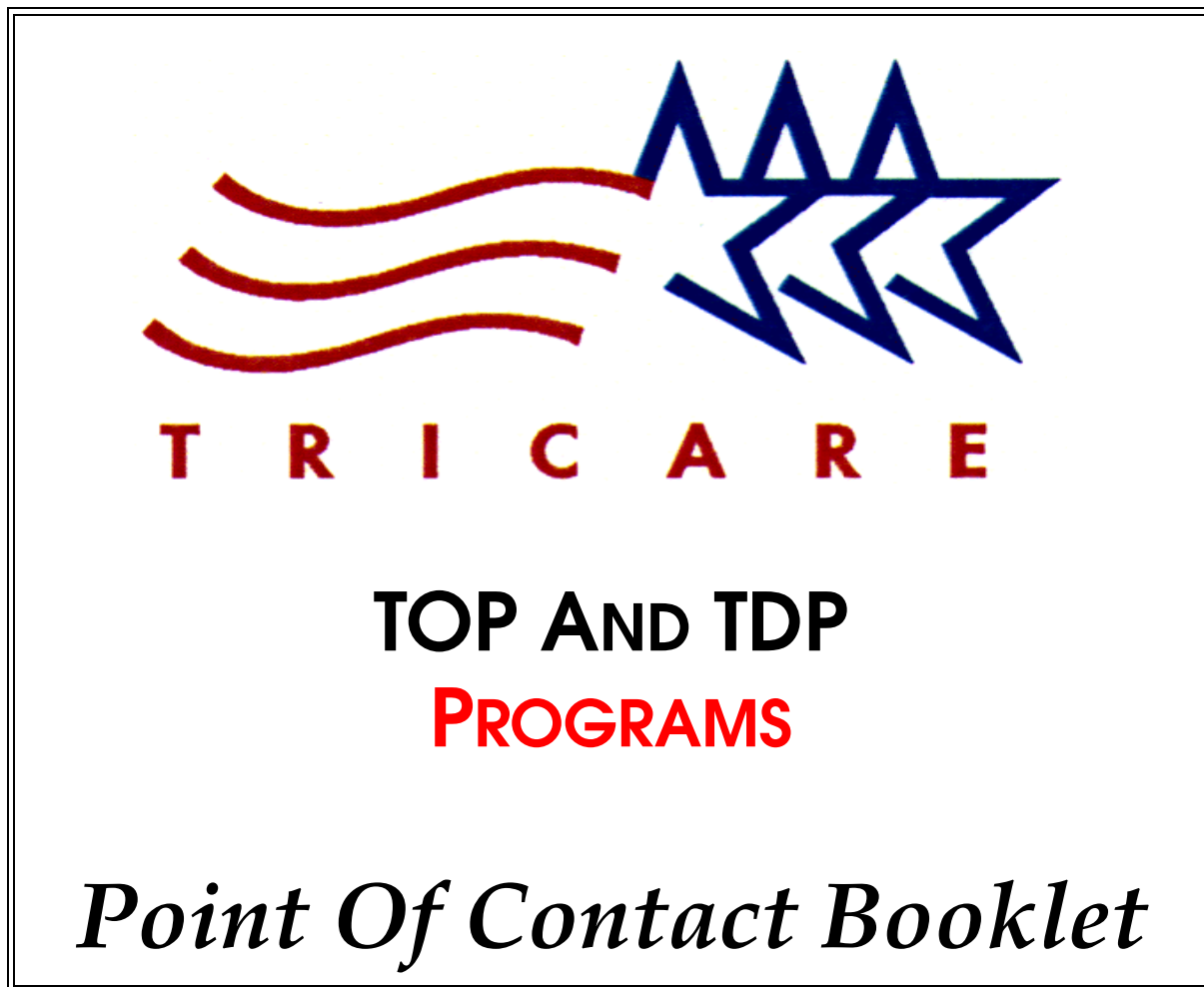
FIGURE 12-12.2-11 TOP AND TDP POINT OF CONTACT PROGRAM BOOKLET