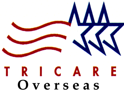
FIGURE 12-12.2-13 TRICARE GLOBAL REMOTE OVERSEAS (TGRO) CONTRACTOR TRICARE PROVIDER APPLICATION

(Sample TGRO Contractor Provider Application)