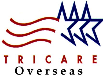
FIGURE 12-12.2-12 TRICARE GLOBAL REMOTE OVERSEAS (TGRO) CONTRACTOR PROVIDER CERTIFICATION REQUEST LETTER

(Sample TGRO Contractor Provider Certification Request Letter)